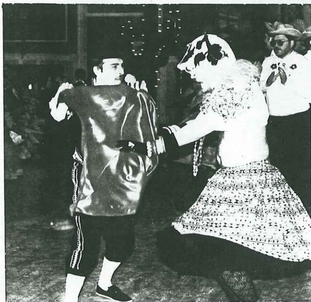
EL TORO! TORO!