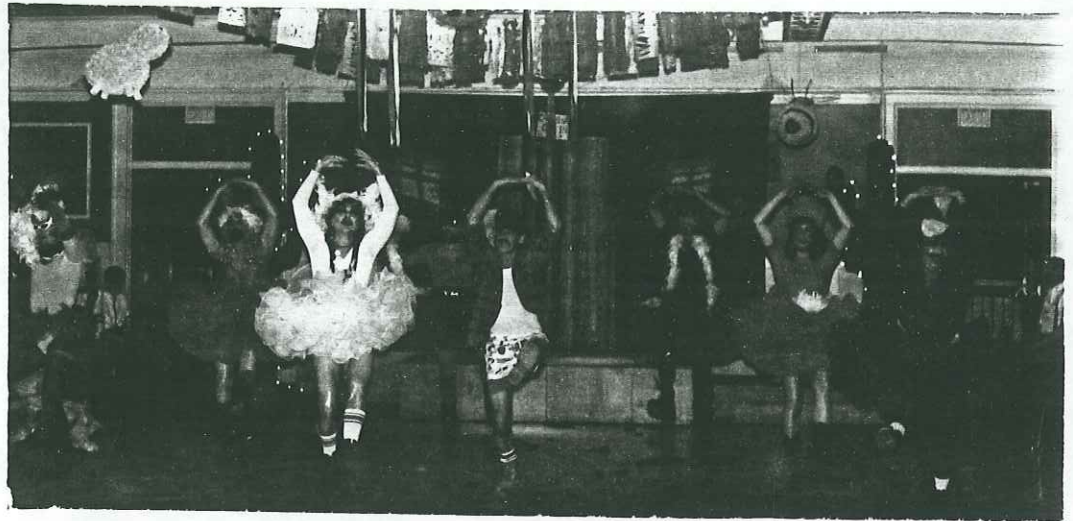
CLEVELAND'S BUX-UM BEAUTIES PERFORMED A FESTIVE "SWINE LAKE"!