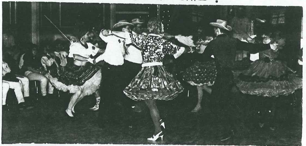
THE TRIANGLE TARTS WERE A BLUR OF COLOURFUL CRINOLINES CIRCLING-LEFT!