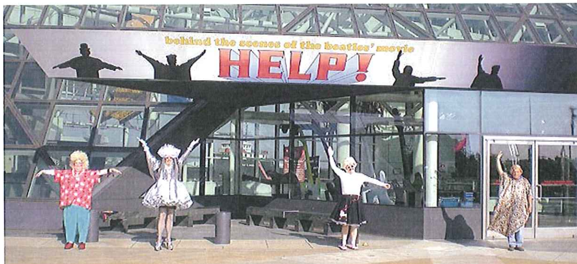
Rock & Rock Hall of Fame, Fun Badge Tour, Touch A Quarter Century – IAGSDC Convention 2008