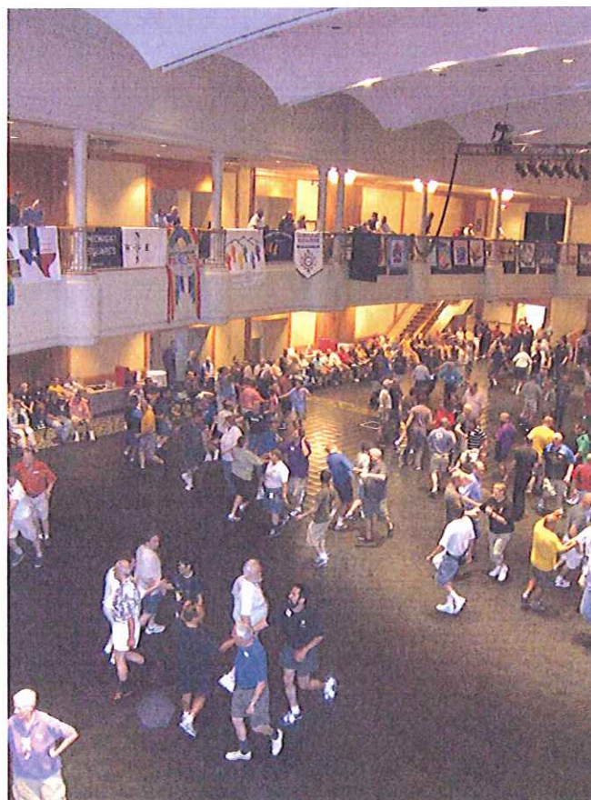
Closing Ceremonies, IAGSDC Convention 2008

Reminder: Please check our telephone line for Club updates: (416) 925-XTRA, ext 2014.